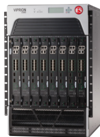
VIPRION 4800 Chassis

BIG-IP PEM is available on the VIPRION C2400, C4800, and C4480 chassis with the B4300 and B4340, both 96 GB blades, and the high-performance 100 GB B4480 blade. BIG-IP PEM is also available as a stand-alone appliance with the new BIG-IP iSeries i5x00, i7x00 and i10x00 appliances, as well as virtual network functions (vPCEF/vTDF) running on BIG-IP virtual editions, which offer the flexibility of a virtual BIG-IP system.