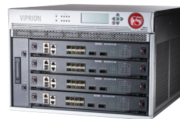
VIPRION 4480 Chassis