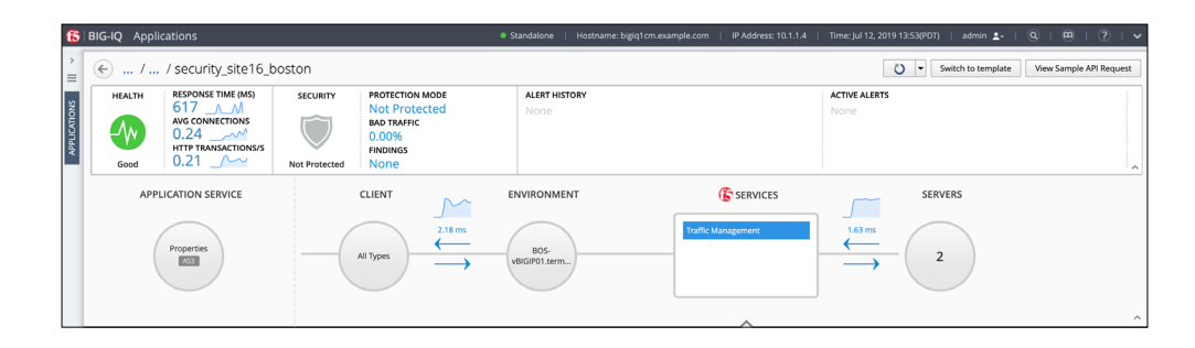
Figure 2: App drill down view-client-to-server analytics and metrics

Ready to take holistic control of your F5 application delivery and security services? Contact us or click here to learn more.